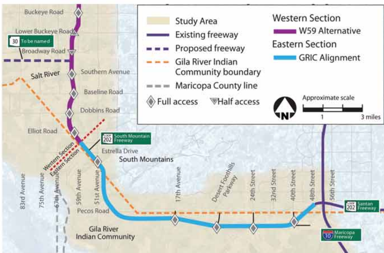
Figure 2. GRIC Alignment